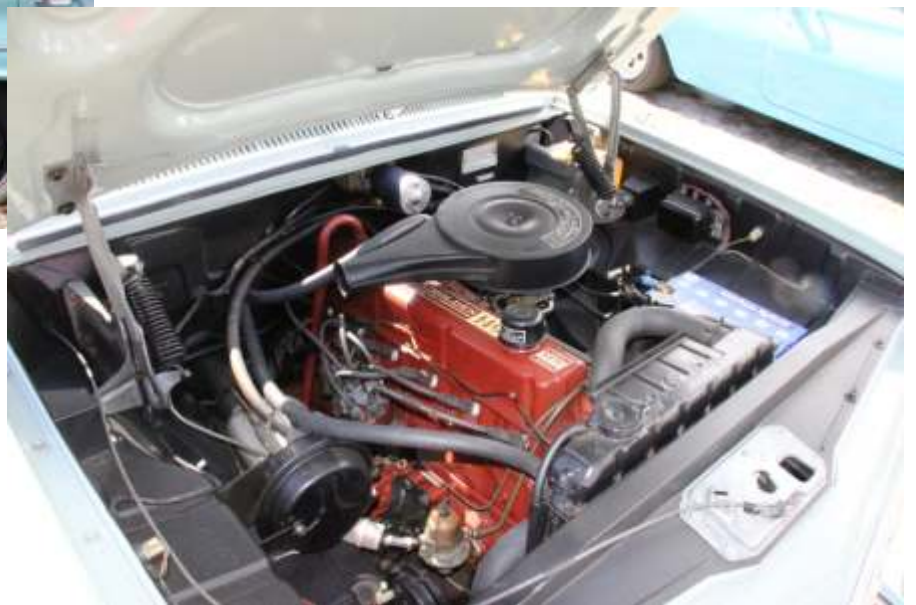
Ray Forster's Engine Bay