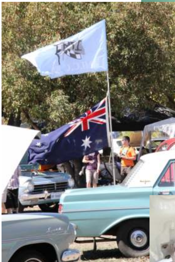
Flag Flying High